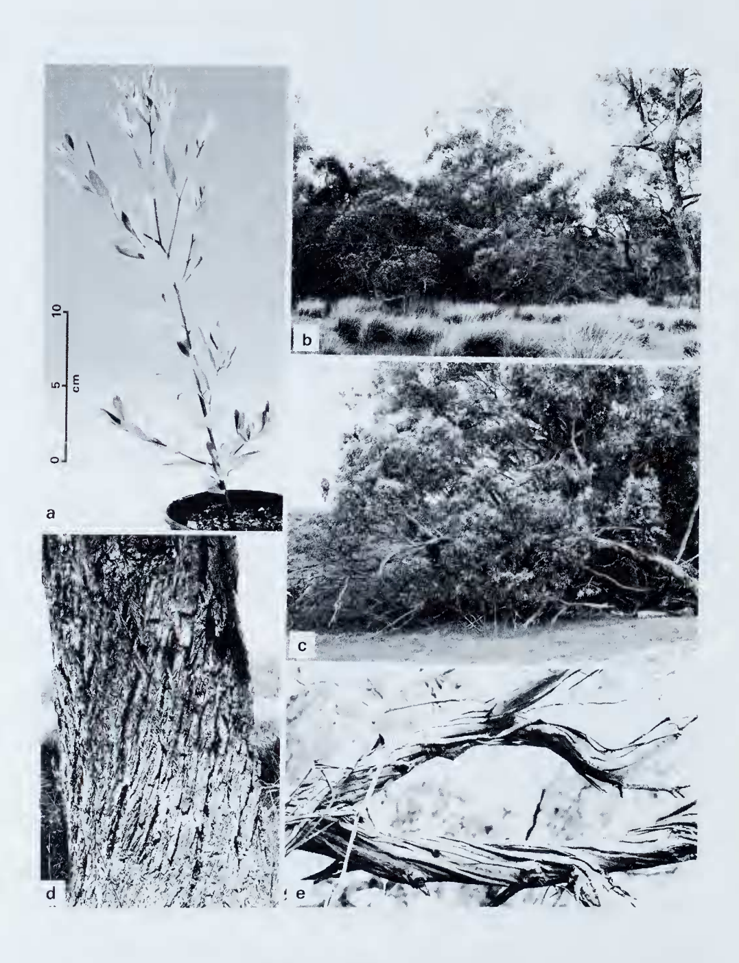
Fig. 2. Eucalyptus cadens. a — seedling, ex J. L. Briggs 2, showing gradation from elliptic seedling leaves to the distinctly narrower juvenile leaves. b — typical habitat with a few standing trees and the bushy crowns of several fallen specimens evident. c — a fallen tree continuing to thrive in its boggy habitat. The paler glaucous new growth is a distinctive feature of this species, d — rough persistent bark forming a stocking to 10 m at the base of the trunks. e — branches showing the smooth bark which decorticates in ribbons.